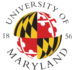
Figure 1: University of Maryland logo.

\begin{figure} \centering \includegraphics[scale=0.7]{umdlogo.pdf} \caption{University of Maryland logo.} \label{logo} \end{figure} See Figure \ref{logo}.